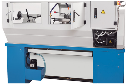
The work area is also accessible through large swinging doors on the back of the machine