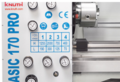
The operator elements are very clearly organized