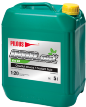
COOLcut Eco 65

In addition to use in saw bands the product is designed for machining operations carried out both on conventional machines and NC and CNC machining centres.