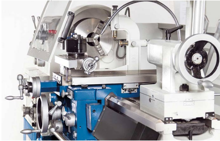
Large steady and follow rests are included