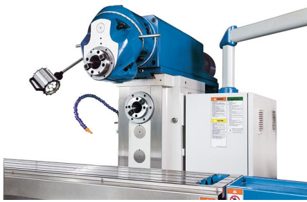
Universal swivel head and horizontal spindle