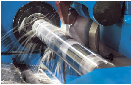
Wet grinding with rotating part