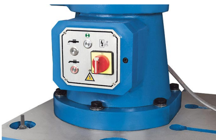
Rigid column base with central main switch