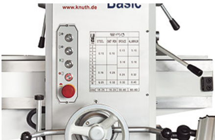
Hand-lever for quill feed is used to control the automatic feed