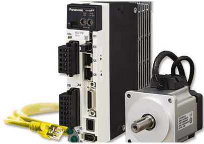
Panasonic servo motors and EtherCAT network type drives