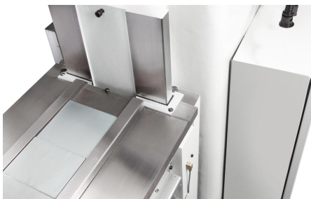
Wide, rigid box ways on Z and Y-axes