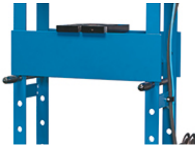
KNWP 30 is shown