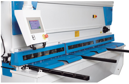
Modern design, with large work table and powerful CybTouch 8 G controller