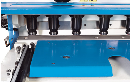
High capacity hold-ons for firm plate holdings