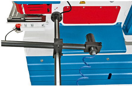
Back gauge with automatic cut activation