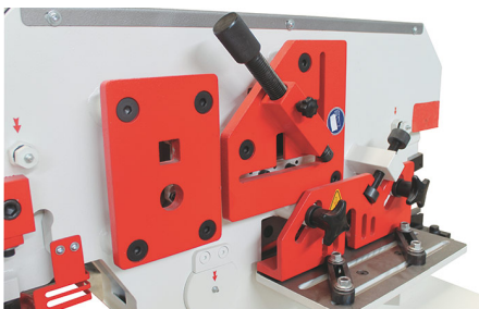
Compact design and excellent rigidity