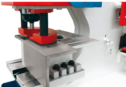
Hole punch station featuring large support table