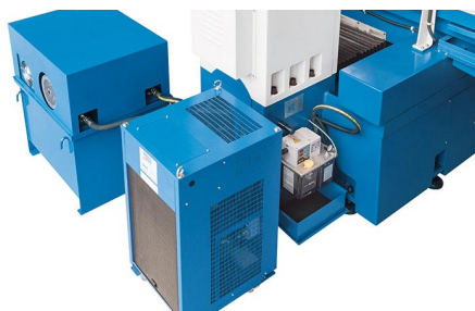
External hydraulic unit and oil cooler ensure thermal stability during continuous operation