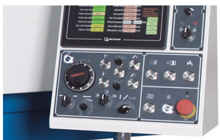
Touchscreen display for easy programming of grinding cycles