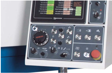
Touchscreen display for easy programming of grinding cycles