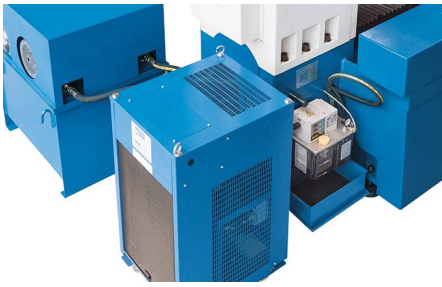
External hydraulic unit and oil cooler ensure thermal stability during continuous operation