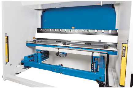
The machines in this series can be retrofitted with a controlled back gauge system with R-axis