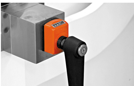
All machines include a manual crowning system inside the table. Motorized crowning is available as optional feature